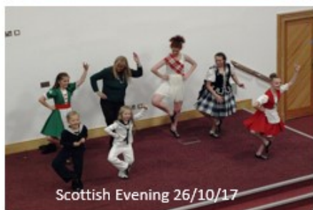
Scottish Evening 26/10/17