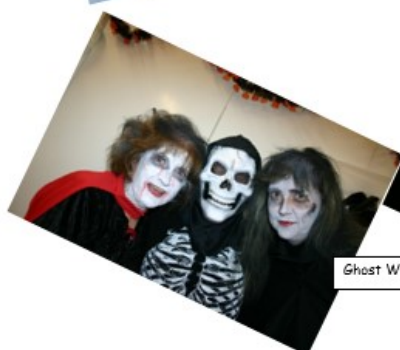
Ghost Walk 3/11/17