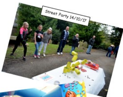
Street Party 14/10/17