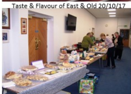
Taste & Flavour of East & Old 20/10/17