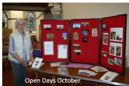
Open Days October