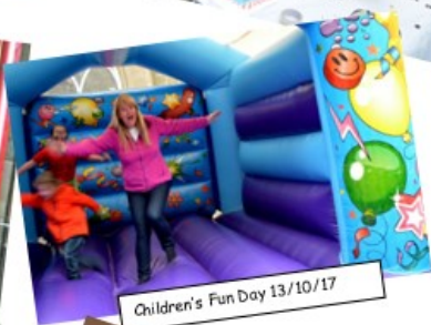
Children's Fun Day 13/10/17