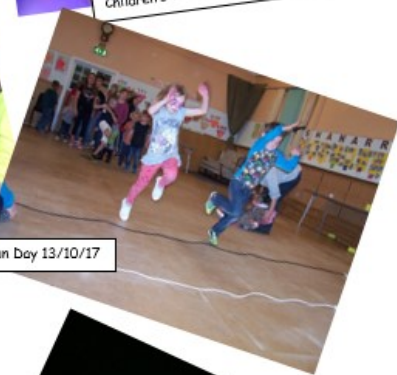
Children's Fun Day 13/10/17