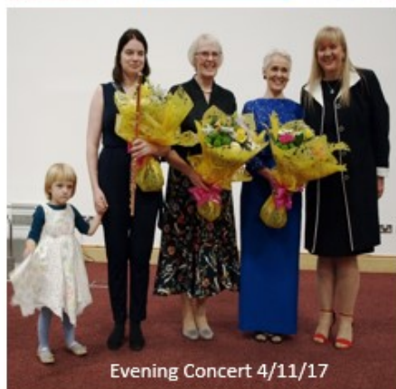
Evening Concert 4/11/17