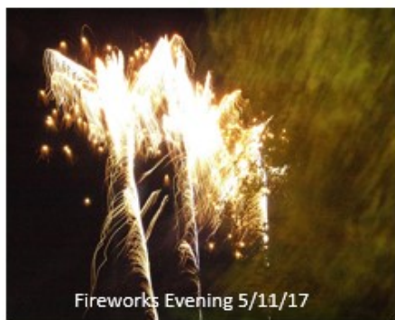
Fireworks Evening 5/11/17