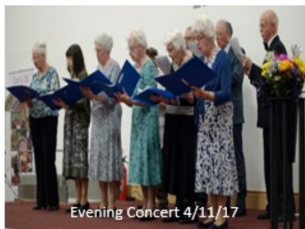
Evening Concert 4/11/17