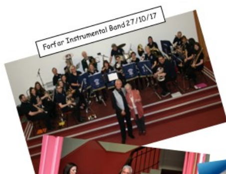
Forfar Instrumental Band 27/10/17