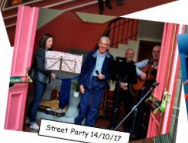
Street Party 14/10/17