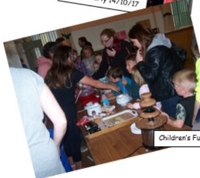
Children's Fun Day 13/10/17