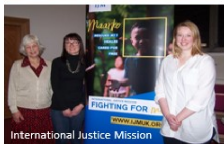
International Justice Mission